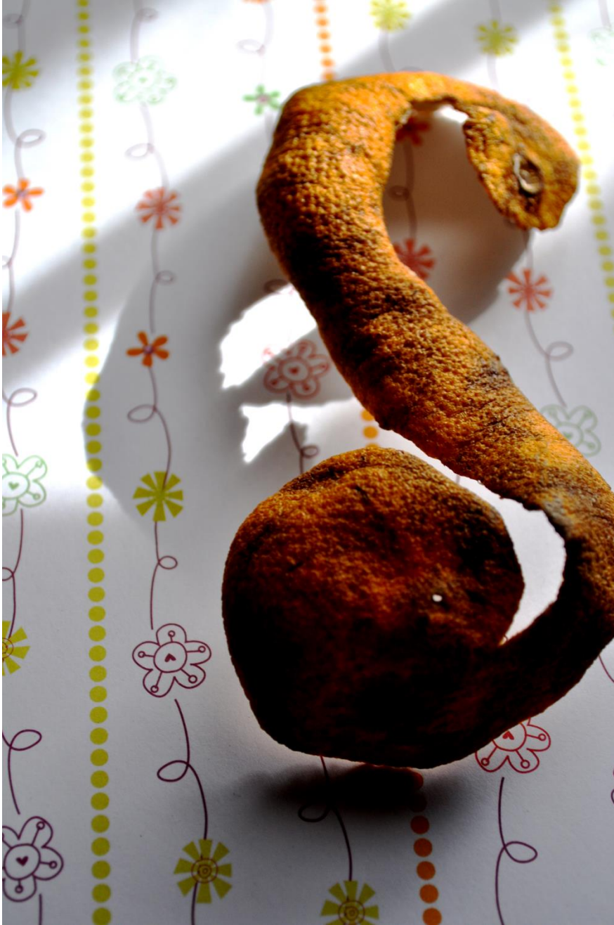
Still-life photo published as part of a book cover, a 2017 winner of the Brain Mill Press Driftless Unsolicited Cover Art Contest.