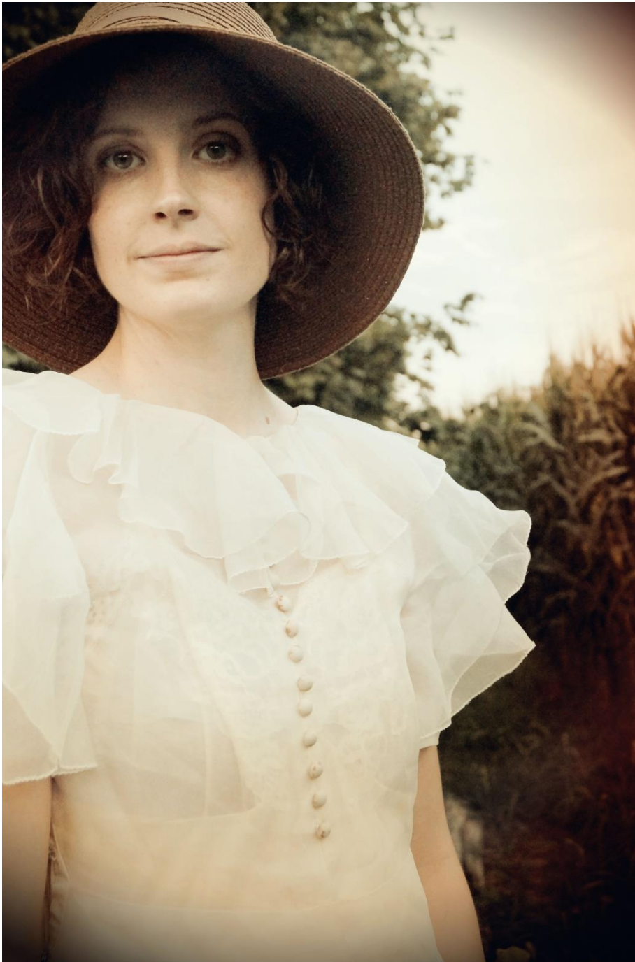
Published in The Scene and Heard Journal , from the Iseult Series