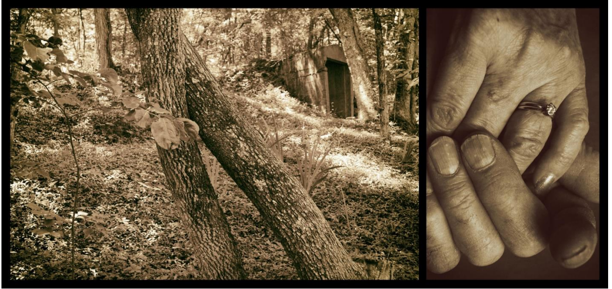
Published in Sum Journal , a diptych from the Moment Series