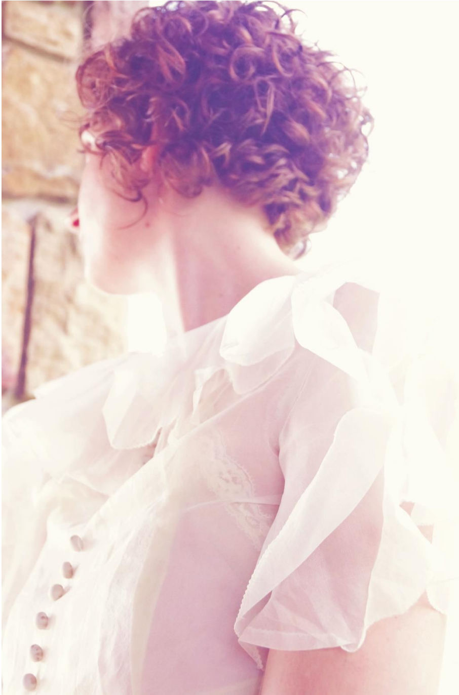
Published in The Scene and Heard Journal , from the Iseult Series