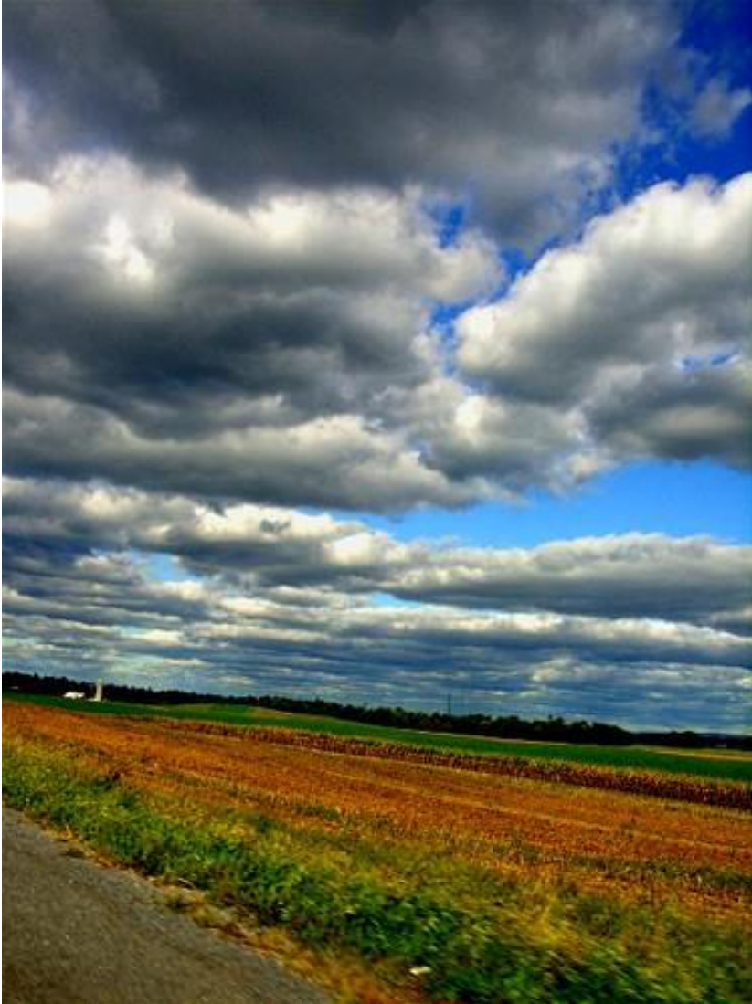
(example of a photo taken from a moving vehicle)