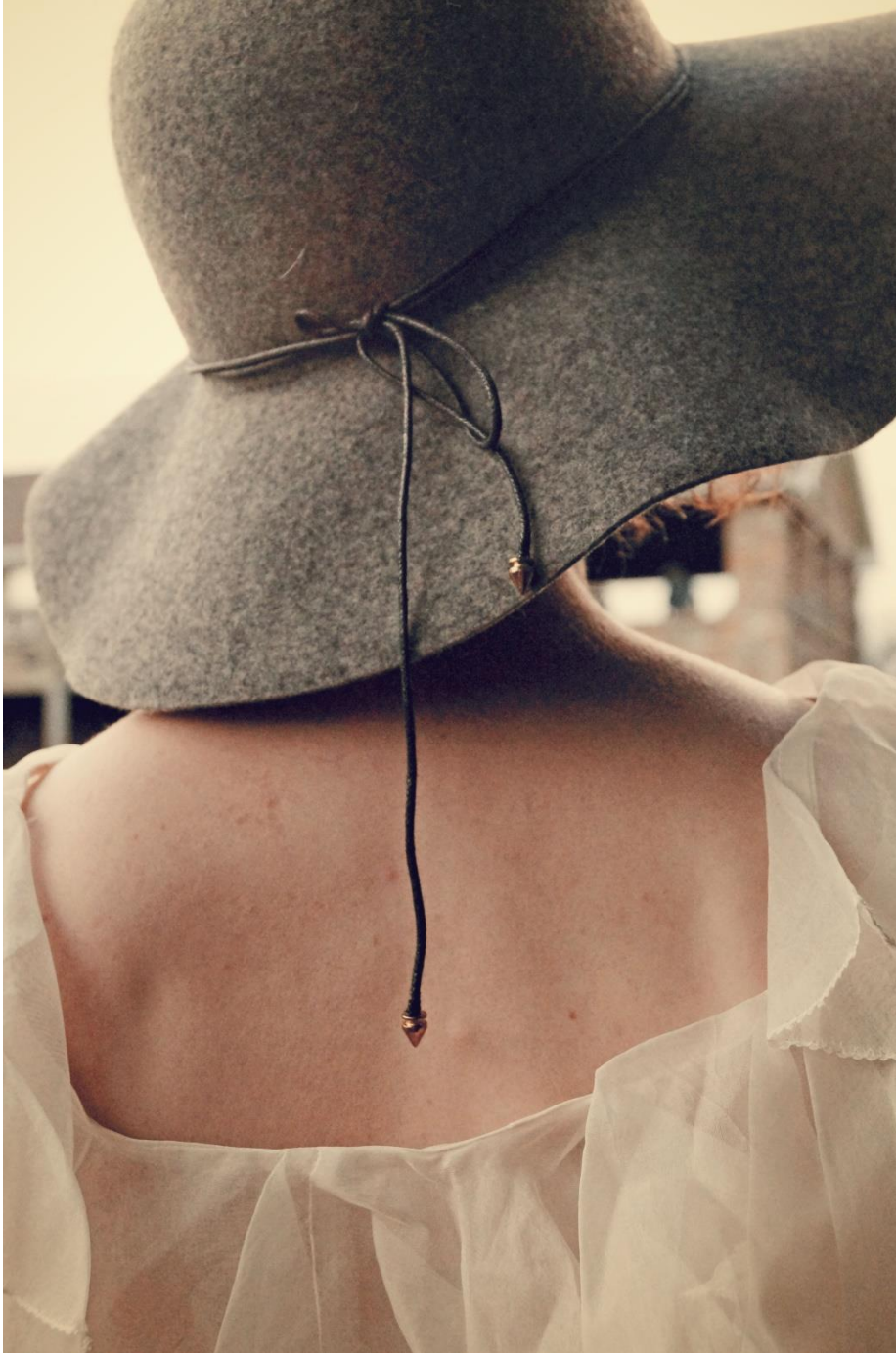
Published in The Scene and Heard Journal , from the Iseult Series